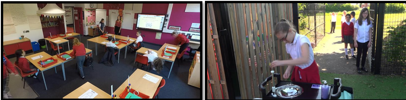
The stars of BBC Six O' Clock News as schools returned after lockdown!

June 1 st , 2020 – After COVID lockdown, our school was chosen to be on the National News (lead story - BBC 6 O'clock News) as children returned to school. Our Y6 children were the stars of the show!