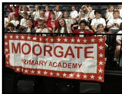
Enrichment is high on our agenda- filling Our children's vessels