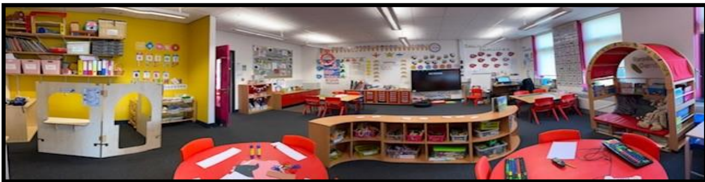
One of our EYFS classrooms which holds up to 24 Nursery children of 2-4 year olds.