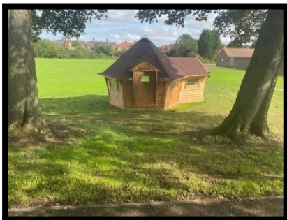
Hollins Wood Lodge in Forest School

Some major installations we have seen in the last 10 years have been: Our amazing Forest School's Area complete with outdoor classrooms and Hollins Wood Lodge, the EYFS playground complete with large play area, the trim trail playground, astro turfing the multi-use games area (MUGA) and our Orienteering course taking children to the four corners of our wonderful site.