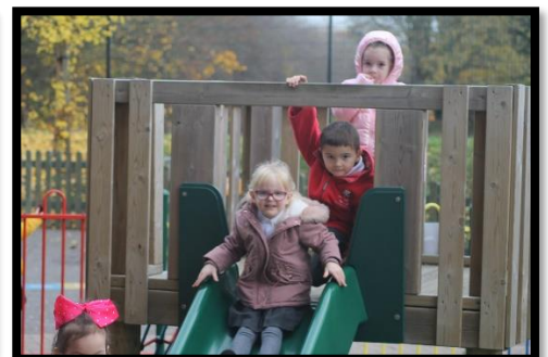
We have developed our learning environment to reflect the curriculum